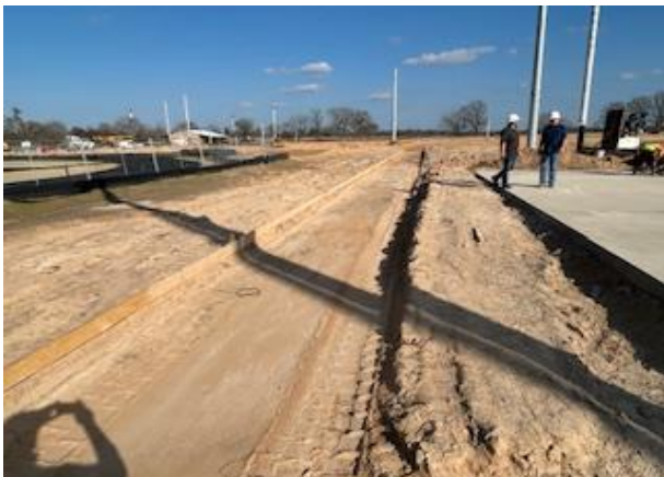
Photograph No 5