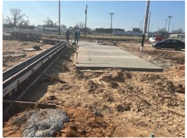
Photograph No 2