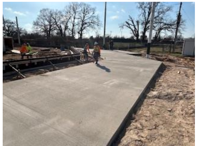
Photograph No 4