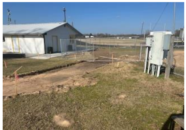
Photograph No 6