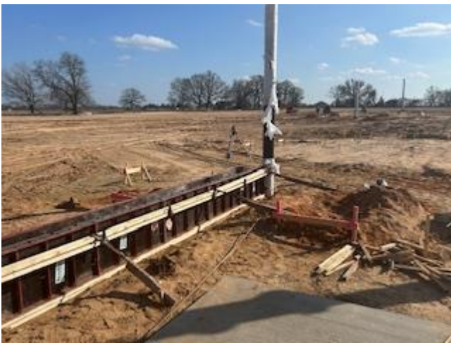
Photograph No 3